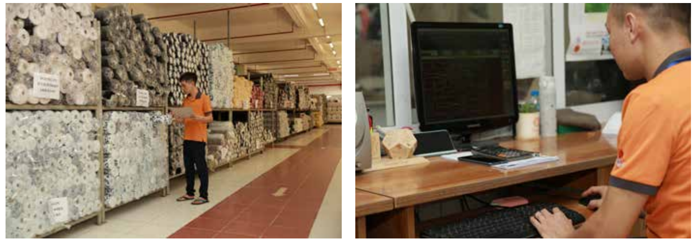
3. Checking raw materials