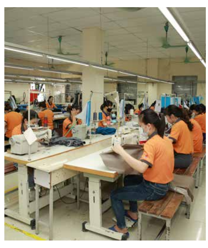
2. Cut and sew samples

All products are tested bonded and test measurement by the skillfull QA & QC that help Hugaco 's name closer and build customers trust with superior quality and perfection.